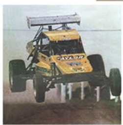
The prototype RC10 (right) and the full-size off-road buggy that inspired Roger Curtis for the design and box art.